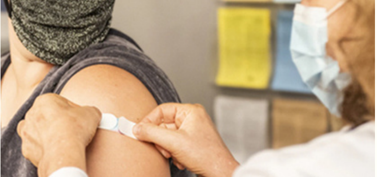
Recharging COVID-19 protection

Disability providers are to communicate the revised COVID-19 booster information with workers, people with disabilities and their families or carers. To recharge COVID-19 protection in 2023, all workers and people with disabilities are advised to check their eligibility for a booster vaccination.